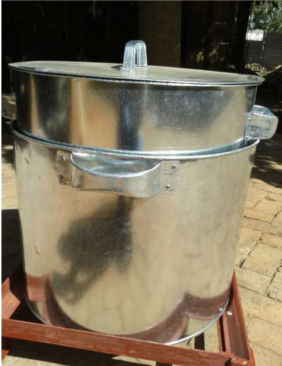
Figure 2. Picture of a Zimba grain weevil disinfesting equipment.

protruding verandah 2 cm wide to aid in preventing entry of steam into the grain. The stand has sides of 52 cm, height 20 cm and a rim 1 cm wide for holding the outer pot in place. A plank, 10 cm long, 5 cm wide and 2 cm thick is used to stir the grain.