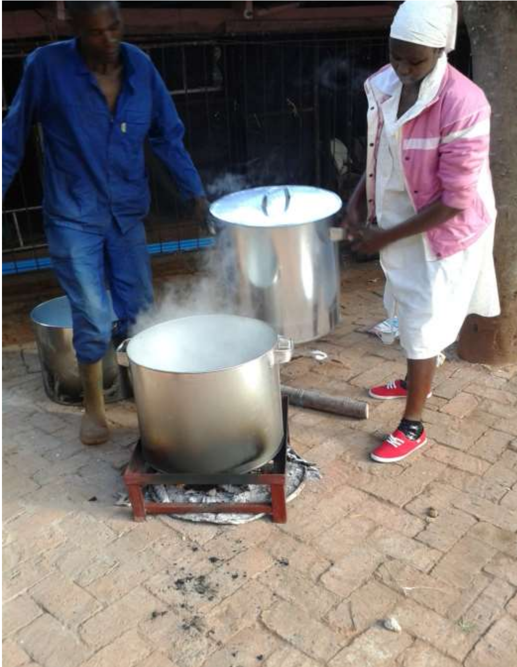
Figure 4. Transferring the inner pot to the outer pot with boiling water.

insects.. After treatment, the maize was exposed to open air for 20 min to allow cooling. The experiment was replicated three times.