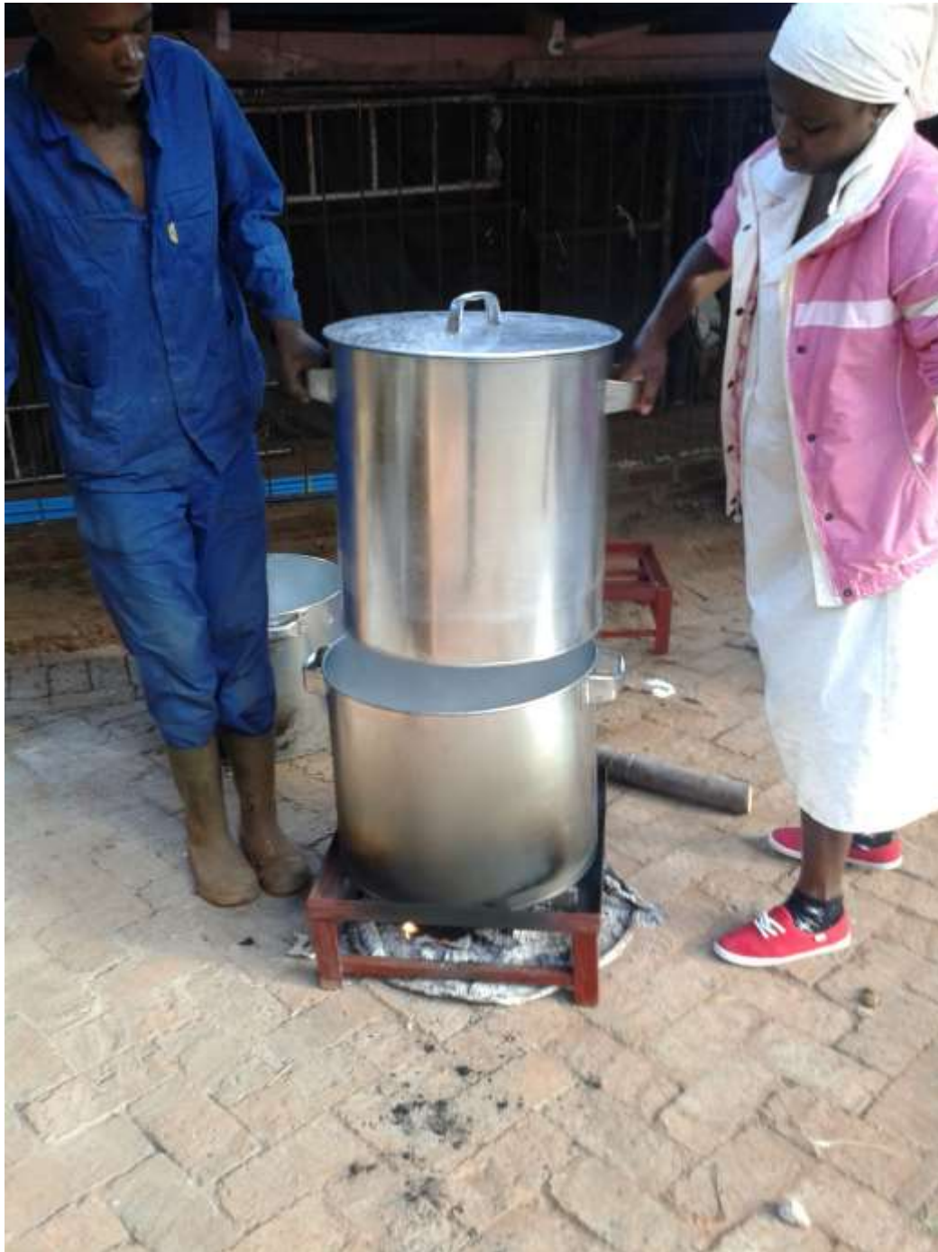
Figure 5. Insertion of the inner pot containing maize grain into the outer pot with boiling water.

measure the difference in germination viability between heat treated and control grain.