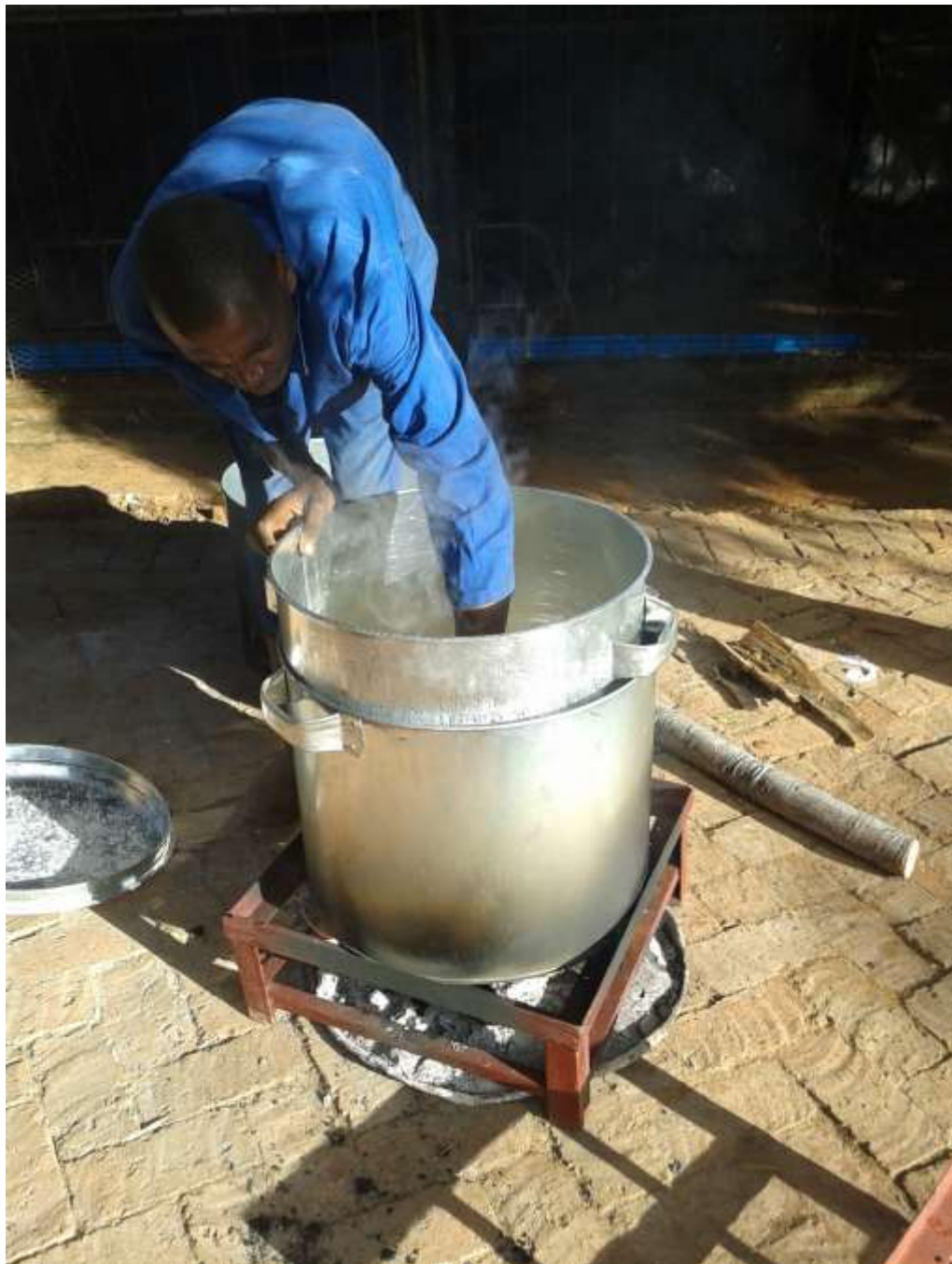
Figure 6. Stirring the maize grain every five minutes using a wooden plank 15×15×0.5 cm to ensure that all grain gets in contact with the bottom and sides of the inner pot and to achieve homogeneous distribution of heat in the grain.

Zimba grain weevil killer achieved 100% mortality of adult P. truncatus and S. zeamais in maize grain following total loss of insect activity at \pm 48^{\circ}\text{C} (when grain was just hot to the palm) (Table 2), achieved at 25 min post exposure to heat (Table 1). Maximum insect activity was observed when grain temperature was between 43 and 45°C (Table 1) attained between 22 and 25 minutes of grain exposure