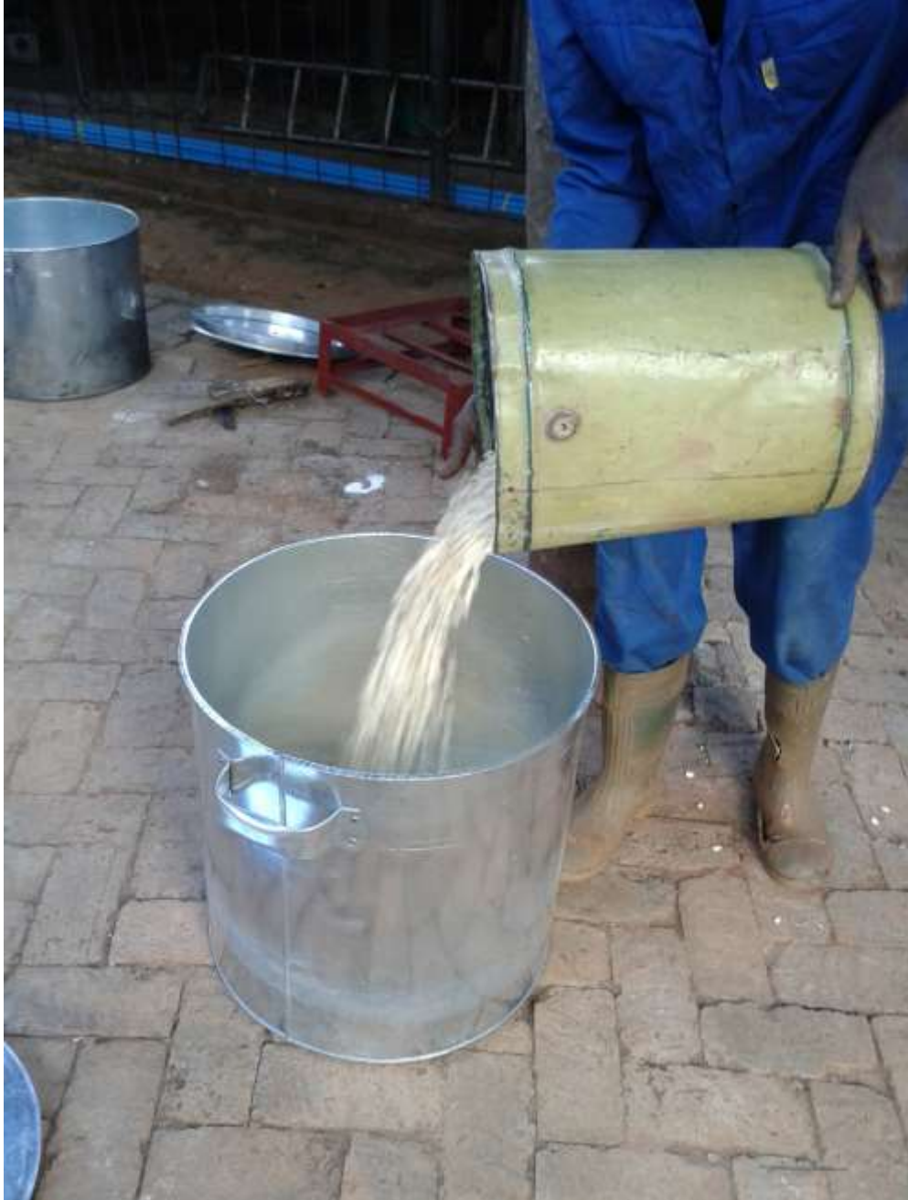
Figure 3. Transferring maize grain into the inner pot.

(Figure 4) and inserted into the outer pot containing two litres of boiling water (Figure 5). The water was maintained at boiling point to the end of experiment. Maize cobs (with grain removed) and maize stalks were used as source of heat. The maize was stirred after every 5 min so that all the grain would come in contact with the bottom and lower sides of the inner pot which were the hottest parts and to allow homogeneous distribution of heat throughout the grain (Figure 6). In the first experiment, temperature was measured every five minutes to establish the relationship of temperature and time when the maize was exposed to heat from water which was constantly at boiling point. A Harbor Digital Thermometer-Long Probe with Instant Read was used to measure the temperature. In